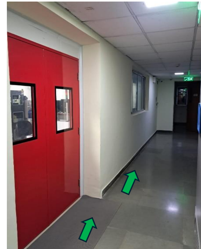
PASF Emergency exit way